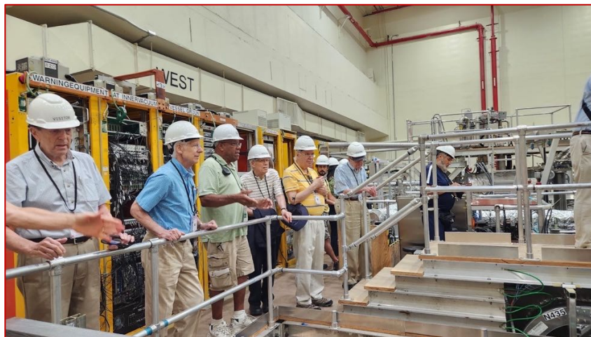
Tour of National Spherical Torus Experiment in Princeton

As we enter 2024, the Summit Old Guard is healthy, vigorous, and enjoyable. Our motto, " Come for the Programs. Stay for the Friends. " has never been more true!